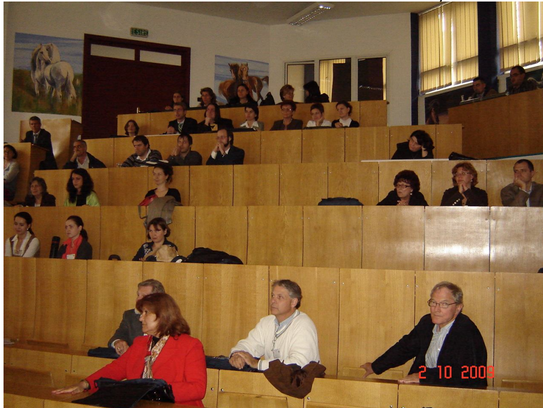
FEBS representatives at the RSBMB conference.