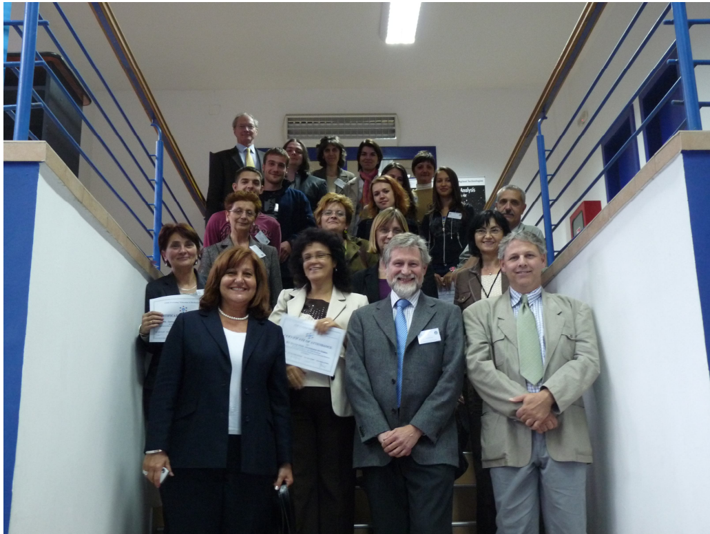
Some participants in the workshop with the FEBS Group